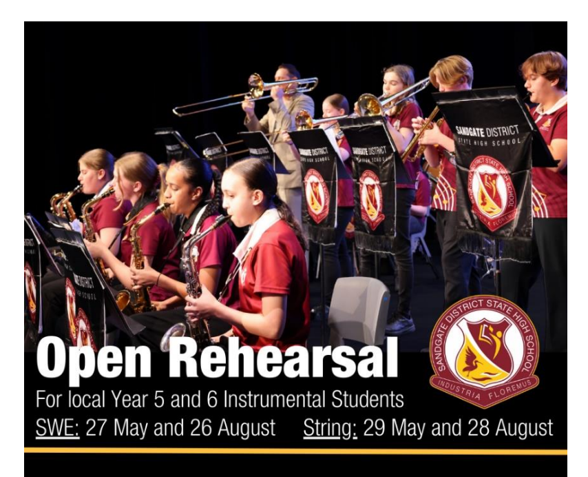
If your Year 5 or Year 6 student plays an instrument and would like to attend please contact our school <u>office</u> so we can send you a digital form via email.